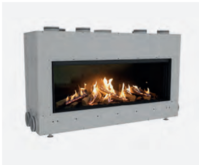
Lina G 60-19