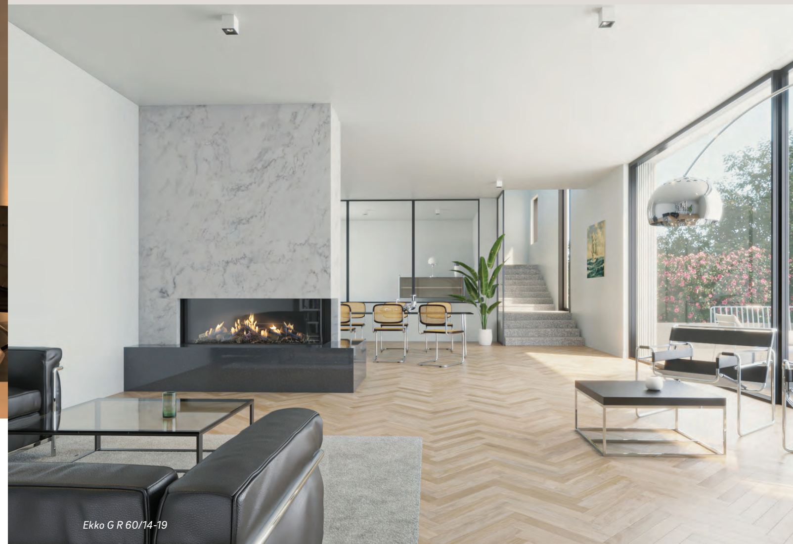
Ekko G R 60/14-19