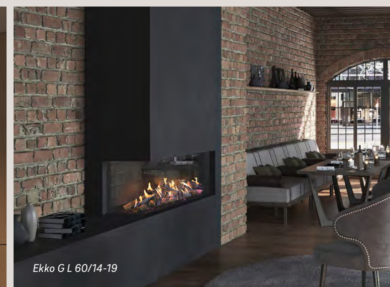
Ekko G L 60/14-19