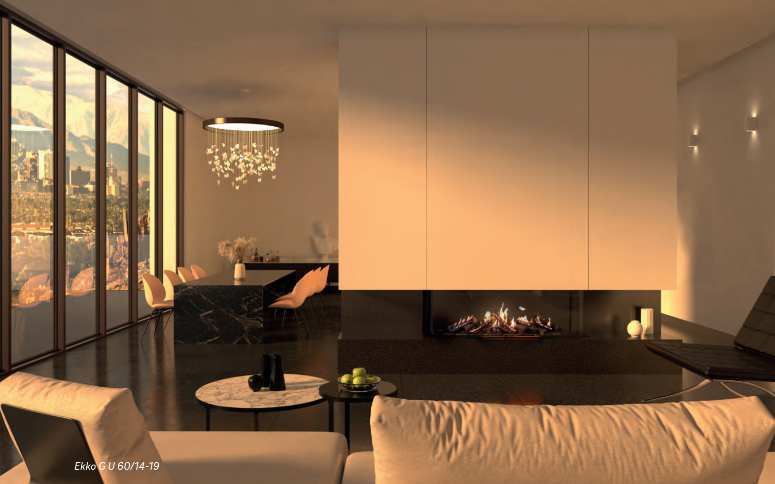
Ekko G U 60/14-19