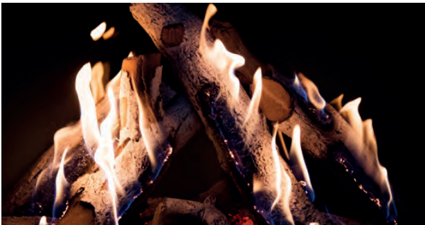
Ceramic logs – Birch