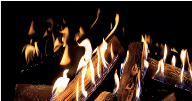
Interior Lining: Ceramic black glass (gloss) – standard

Our accessories help you personalize the fireplace of your dreams. Interior linings, wood logs, air distribution systems and many control options help ensure your fireplace suits you perfectly.