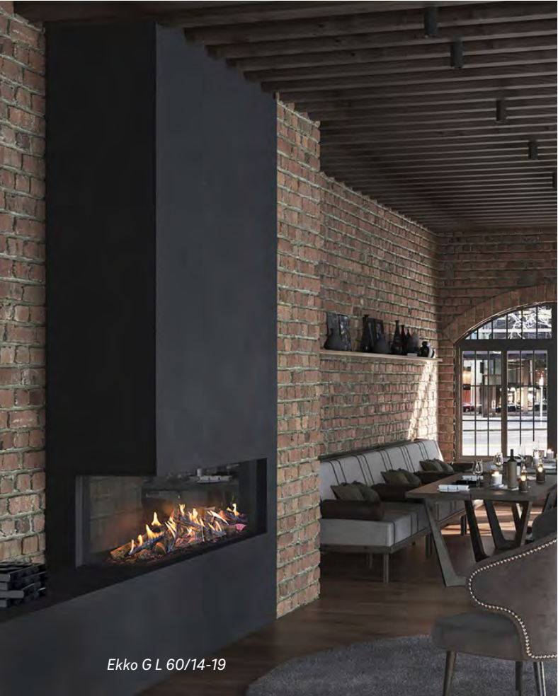
Ekko G L 60/14-19