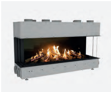
Ekko G U 60/14-19