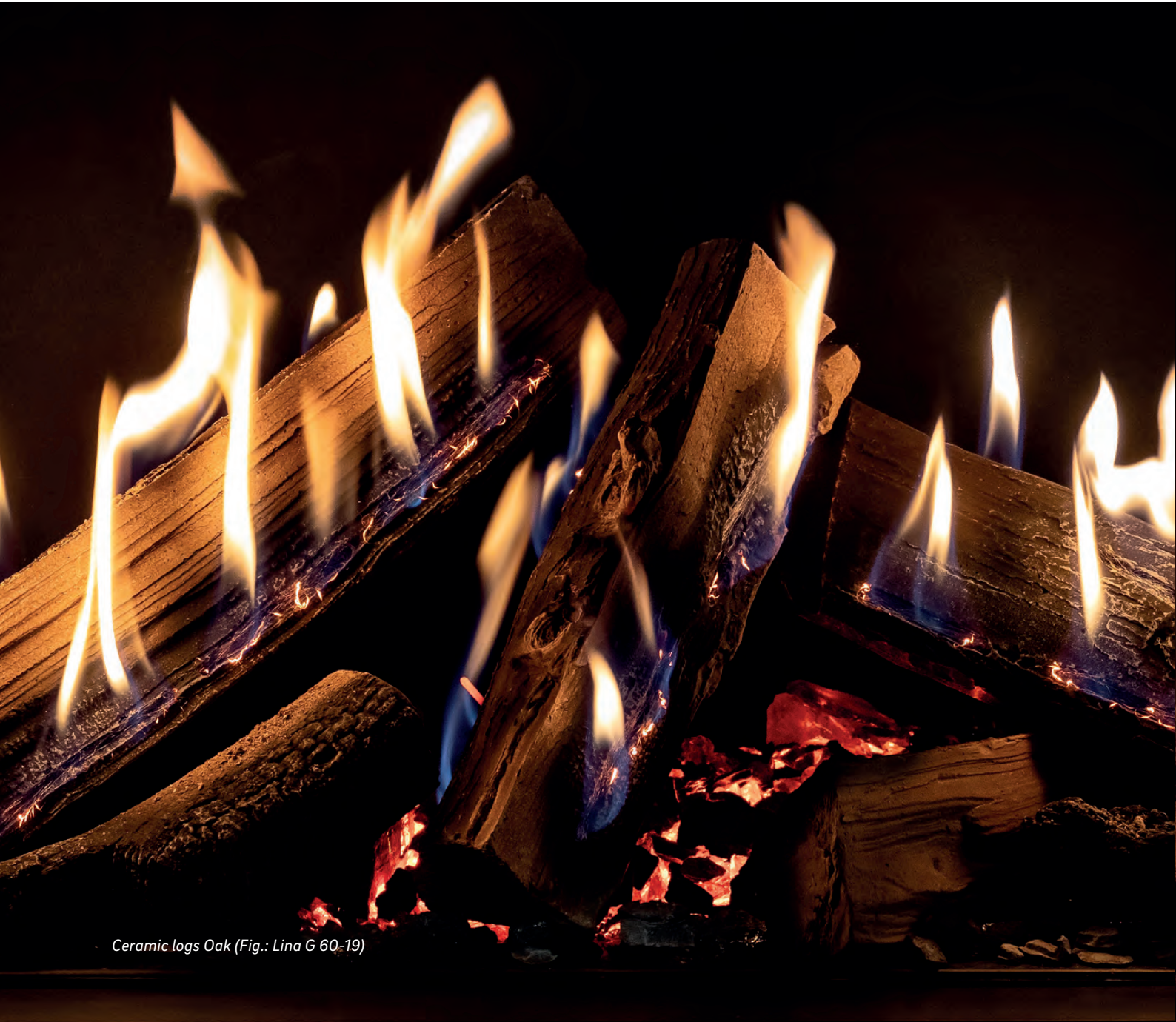
Ceramic logs Oak (Fig.: Lina G 60-19)

The smooth, papery bark of birch gives off a beautiful reflection of light. In contrast with a darker interior lining, depth and space are created. This space is an attention-getter, welcoming reflection.