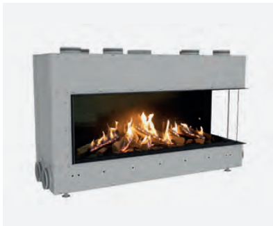
Ekko G R 60/14-19