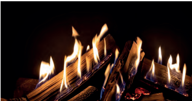
Interior lining: Anthracite (matte) – optional