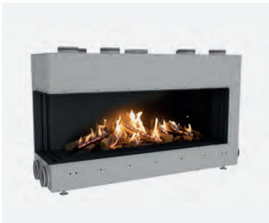
Ekko G L 60/14-19