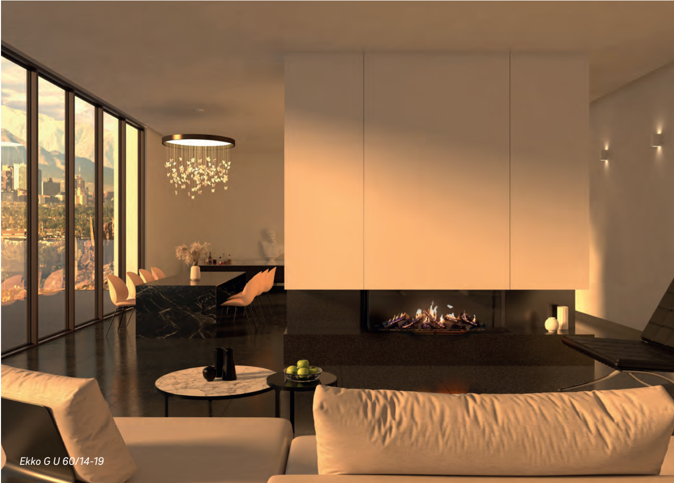
Ekko G U 60/14-19