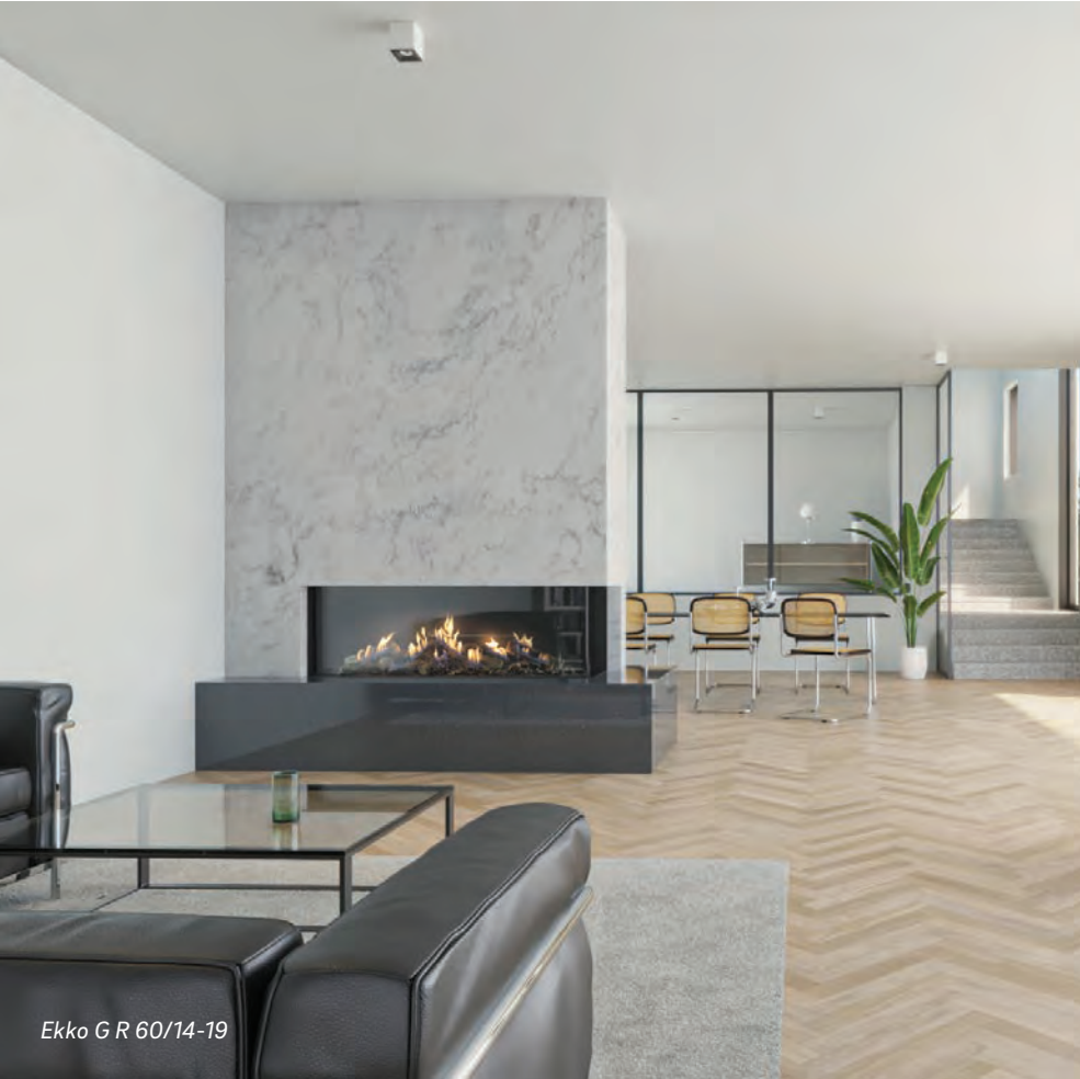
Ekko G R 60/14-19