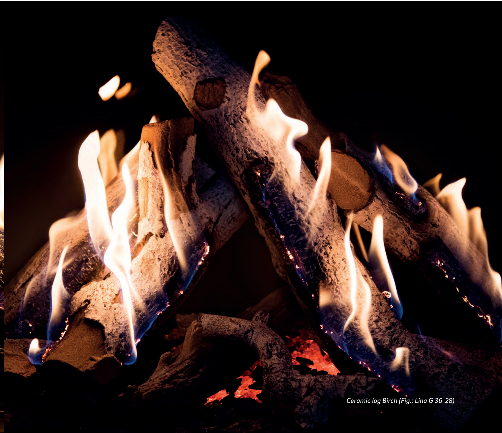
Ceramic log Birch (Fig.: Lina G 36-28)