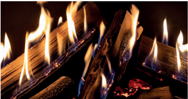
Ceramic logs – Oak