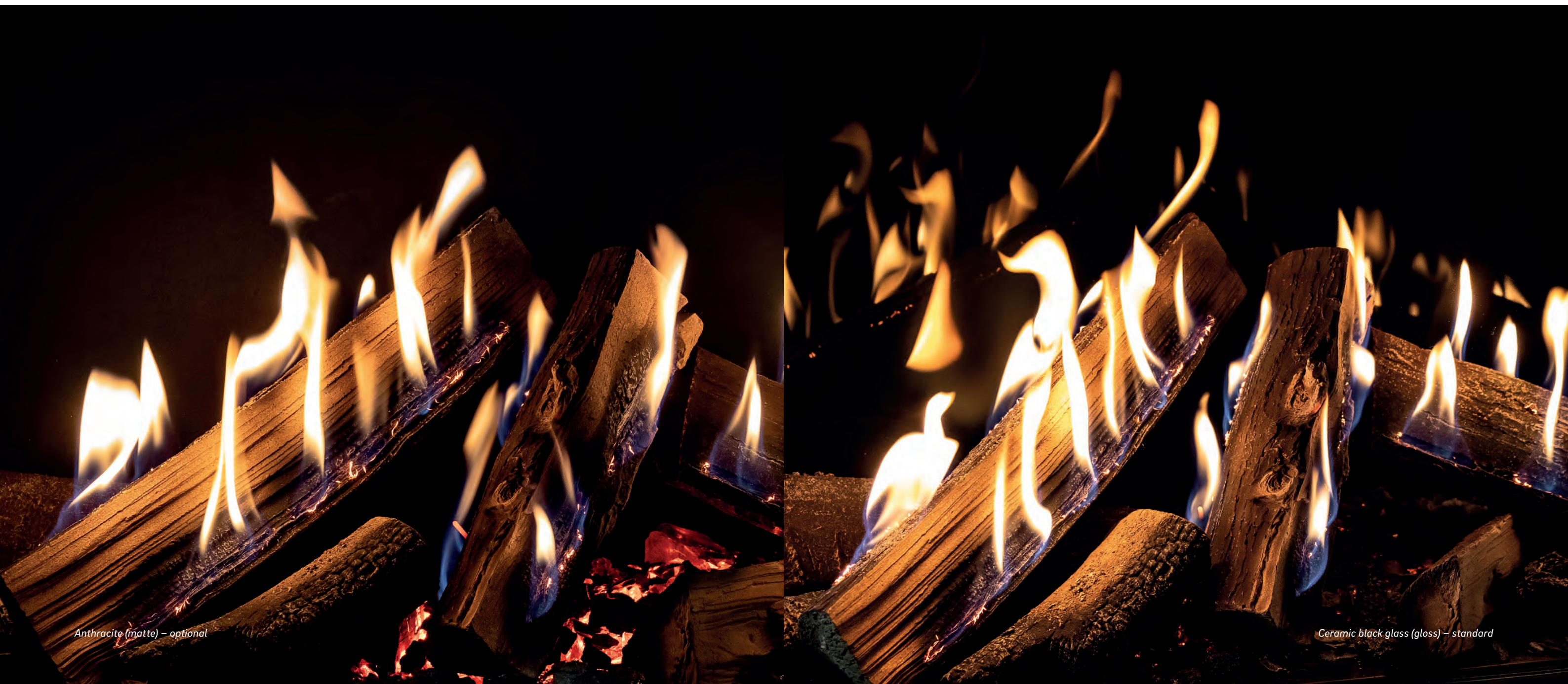
Anthracite (matte) – optional