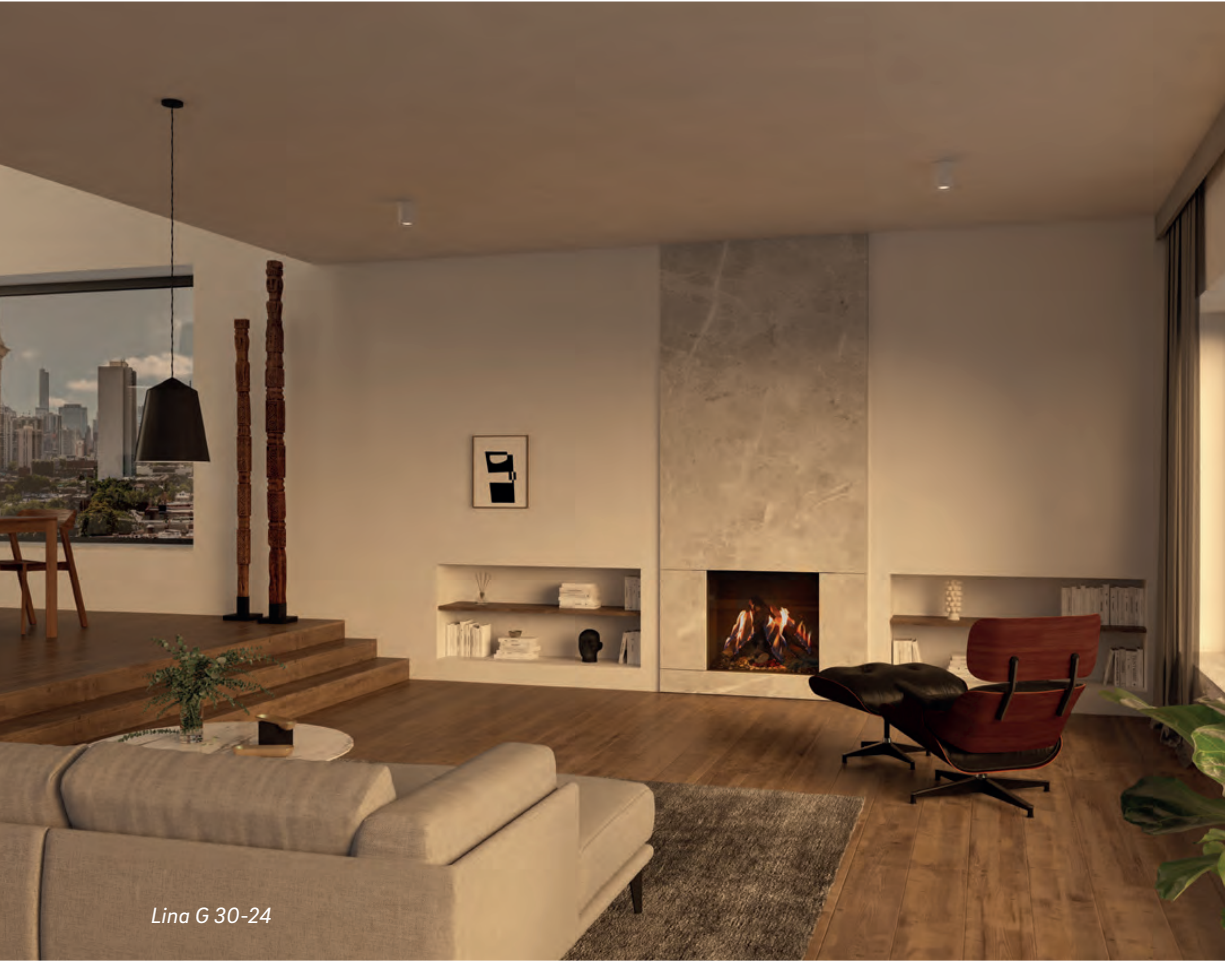
Lina G 30-24